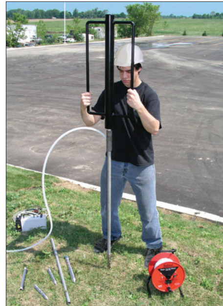
Installing Piezometers with a Manual Slide Hammer

Solinst Drive-Point Piezometers can be driven into the ground with any direct push or drilling technology, including the Manual Slide Hammer shown at right. To avoid clogging or smearing of the screen during installation, a shielded version is also available.